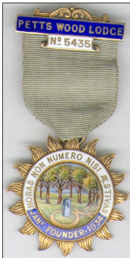
One of two remaining Founders Jewels from the Lodge Archives