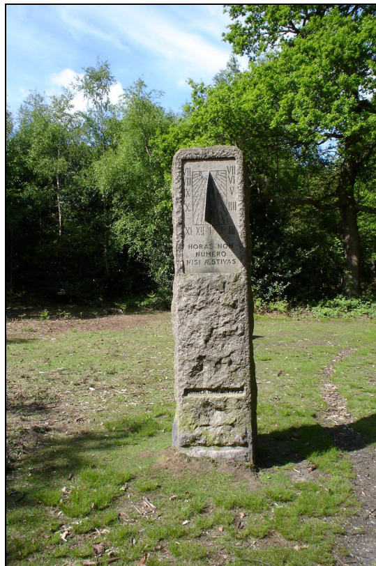
William Willett and the Memorial Sundial in Chislehurst Woods